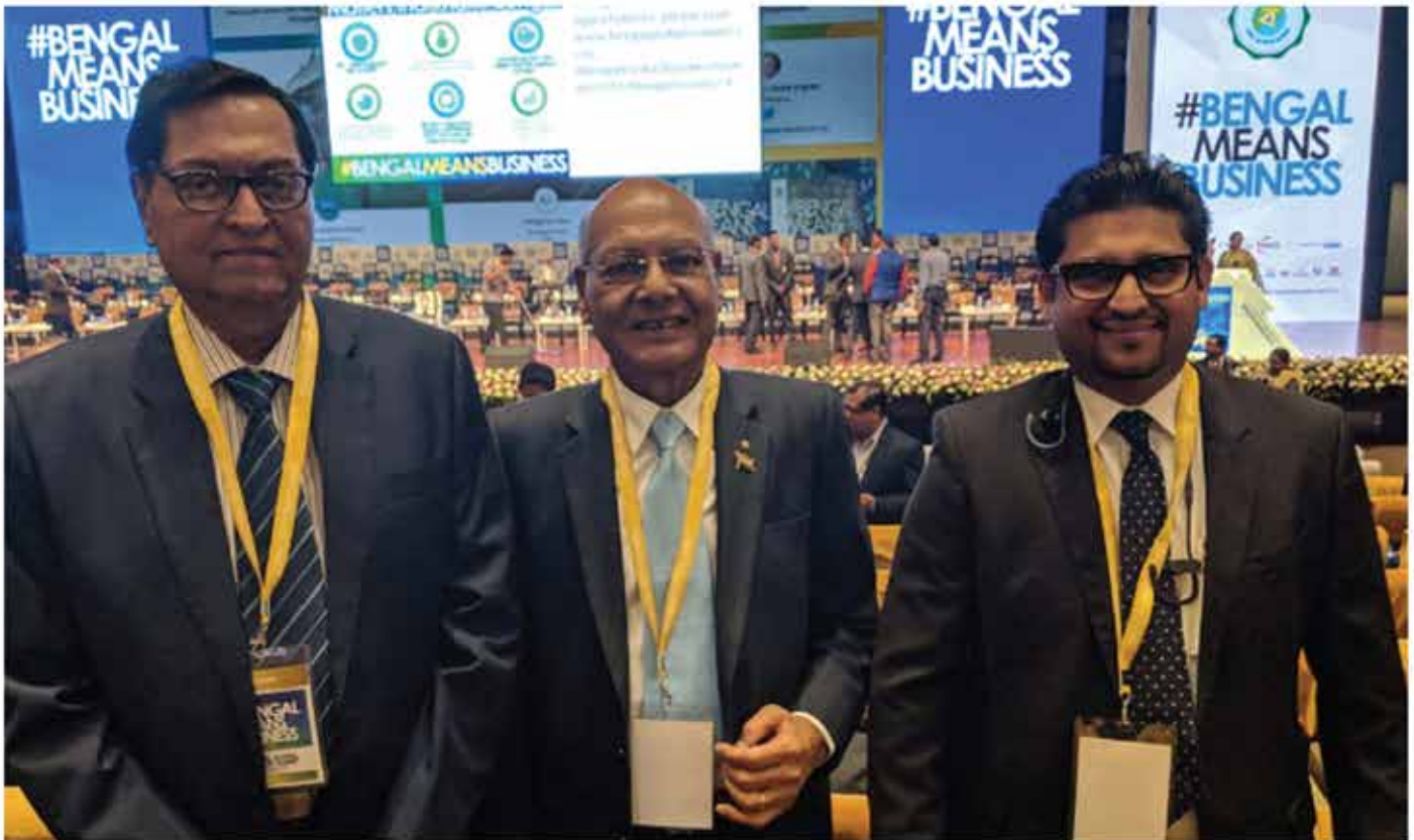
The Office Bearers of Calcutta Chamber of Commerce attended the meeting of the Bengal Global Business Summit held on 7th February, 2019.