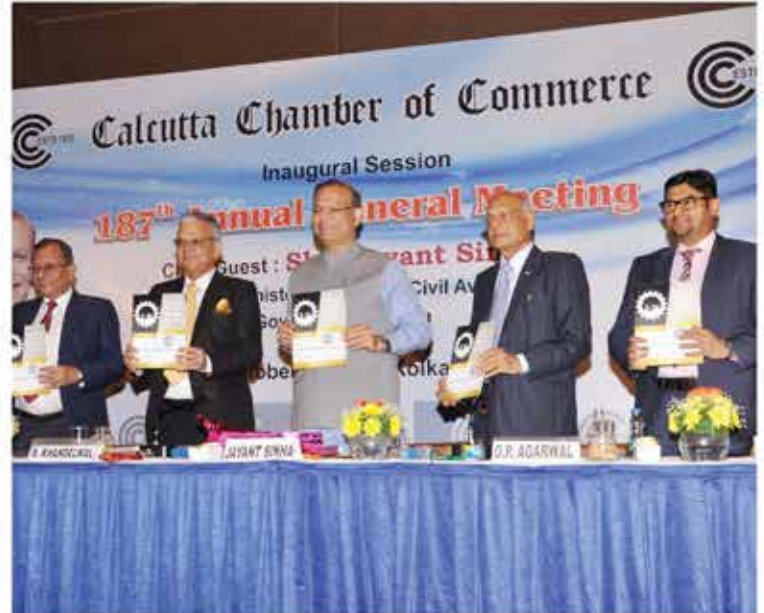
Hon'ble Minister Mr. Jayant Sinha releasing the Year Book of the Calcutta Chamber of Commerce.

Mr. Sinha also pointed out that this frontier industries give employment to 10 million people out of which 4 million are in IT services. They are supporting additional 30 million jobs in indirect frontier job, he said and we can go from 10 million frontier jobs to 50 million frontier jobs in the next 20 years, he added, which means 2 million jobs a year. And hence, the total number of jobs that are linked to highly productive industries, like IT Services, automotive banking