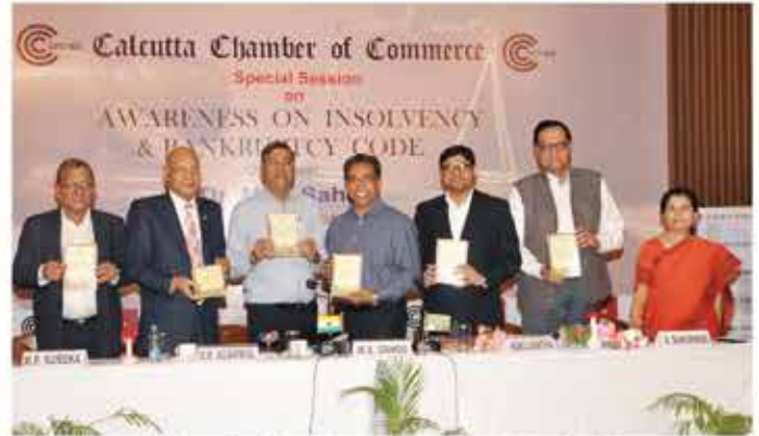
Office Bearers of Calcutta Chamber of Commerce are releasing Members' Directory 2019