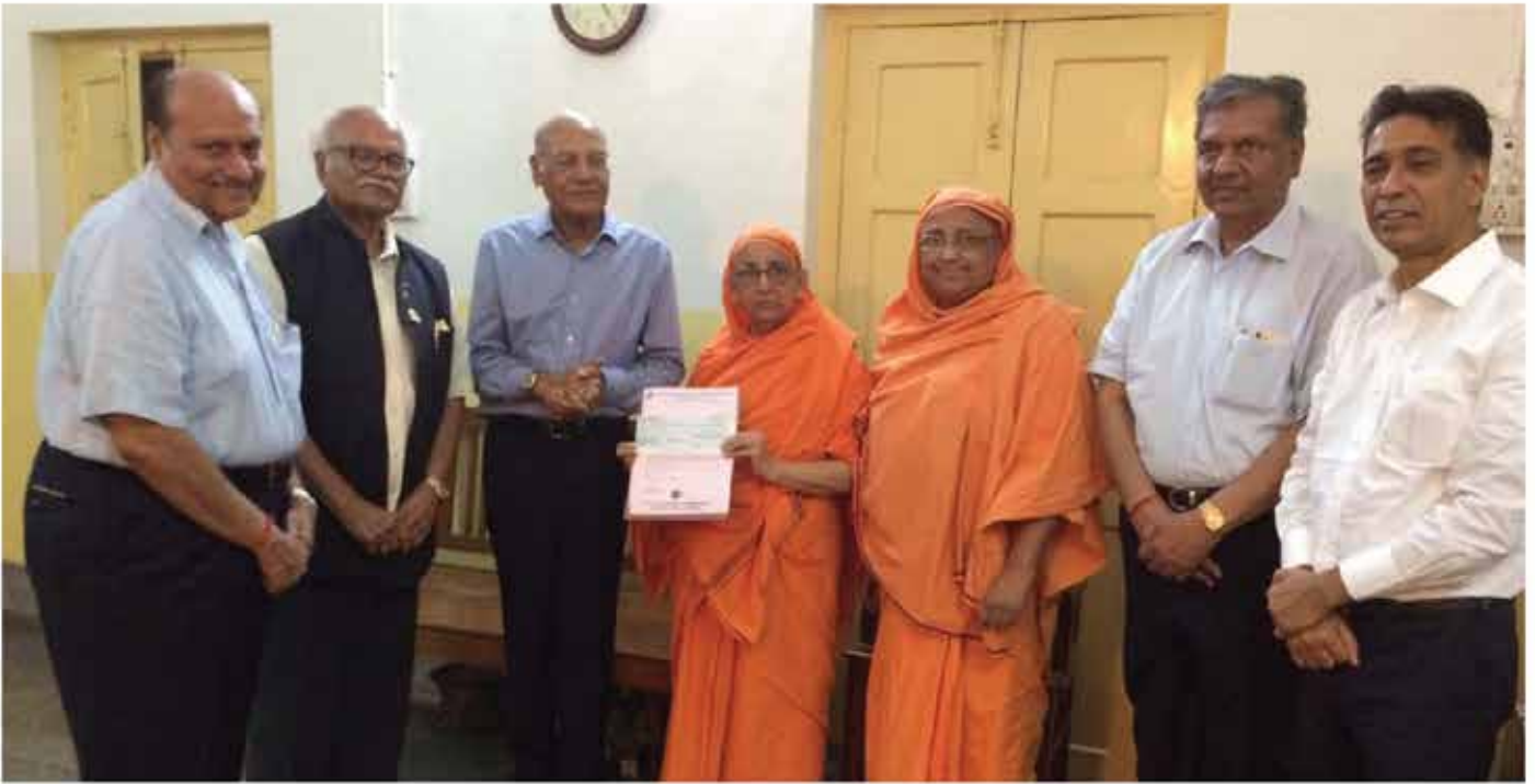
The Trustees of the Calcutta Chamber of Commerce Foundation presenting donation (pertaining to Prabha Khaitan Puraskar) to the Head of Ramkrishna Sarada Mission Matri Bhavan.