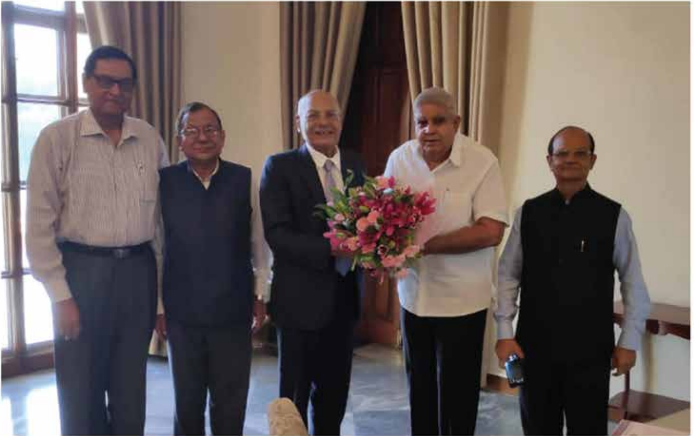
President and office bearers of Calcutta Chamber of Commerce with Hon'ble Governor of West Bengal Shri Jagdeep Dhankhar at Raj Bhavan