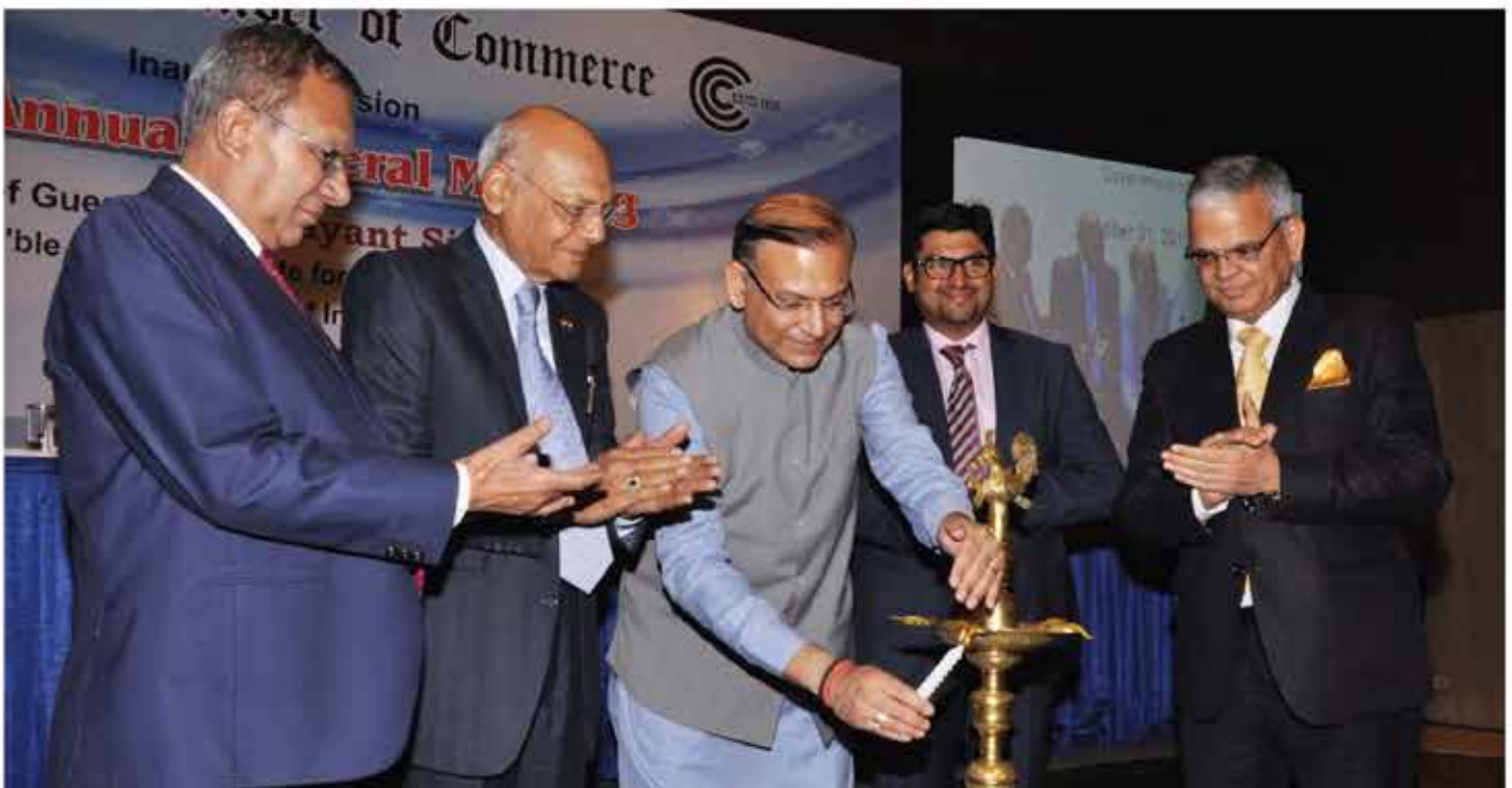
Mr. Jayant Sinha, Hon'ble Union Minister of State for Civil Aviation lighting the inaugural lamp at the 187th Annual General Meeting of the Chamber.

According to Mr. Sinha such platforms will enable people to get to the productivity frontier and hence they act as game changers for India's development. There are many frontier industries and frontier companies where people are very productive, generating high output, developing more ways of innovations and thus making them globally competitive too, he pointed out. He said the challenges for us now, as we have about total formal jobs of 75 billion or so, out of which Government jobs are about 15 million and we have other jobs of about 50 million, is to think about how we can increase the number of direct frontier jobs as well as develop more and more ways of innovations.