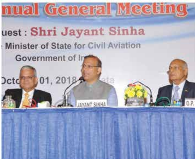
Mr. Jayant Sinha, Hon'ble Minister interacting with the audience.

By following this development model, our GDP per capita will likely to increase from about $1,800 to $5,400 and overall GDP will reach about $10 trillion in the next 20 years – making us a prosperous middle-income country.