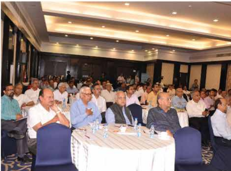
A glimpse of the gathering.