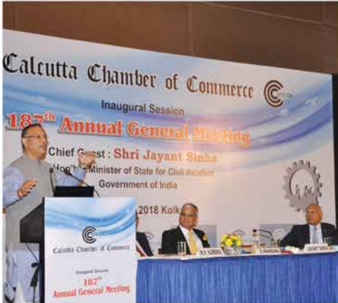
Mr. Jayant Sinha, Hon'ble Minister delivering his key note address at the 187th AGM.