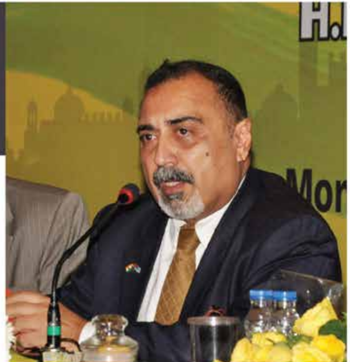
H.E. Mr. Yogesh Punja, High Commissioner of Fiji in India highlighting on the investment prospects of India in Fiji.

Fiji's High Commissioner to India Yogesh Punja said bilateral trade between India and his Pacific Ocean island country has massive growth potential as it can be used as a "bouncing board" to the markets of Australia and New Zealand. Noting that the current annual trade between India and Pacific Island Countries (PICs) currently hovers at around $300 million, he said the trade is low in volume due to their small population, market sizes and long distance from India. The number of total Indian tourists is only around 5,000. So it is very low. People do not need visas to enter Fiji. So we certainly hope to increase the tourist traffic from India," he said.