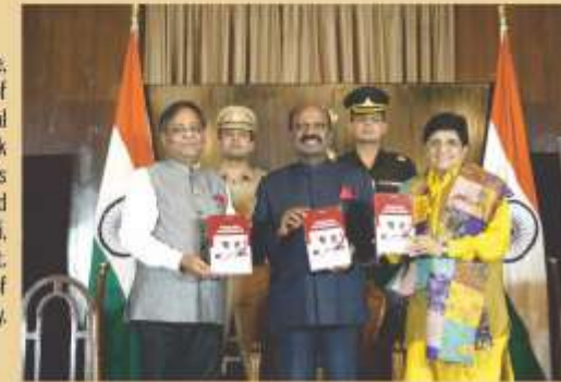
Dr. C.V. Ananda Bose, Hon'ble Governor of West Bengal introducing the book on 'Fearless Governance' authored by Dr. Kiran Bedi, Hon'ble Former Lt. Governor of Puducherry.

She said, 'It was not a lonely work, it was a strong team work where people of Puducherry was part and parcel of these challenges. Some parts of the content show that administrators, lieutenant governors, executives or bureaucrats can actually work together in coordination with politically elected representatives. And when they are in line, they can do wonders in administration. This book gives an account of the leadership quality which are required to render good governance'.