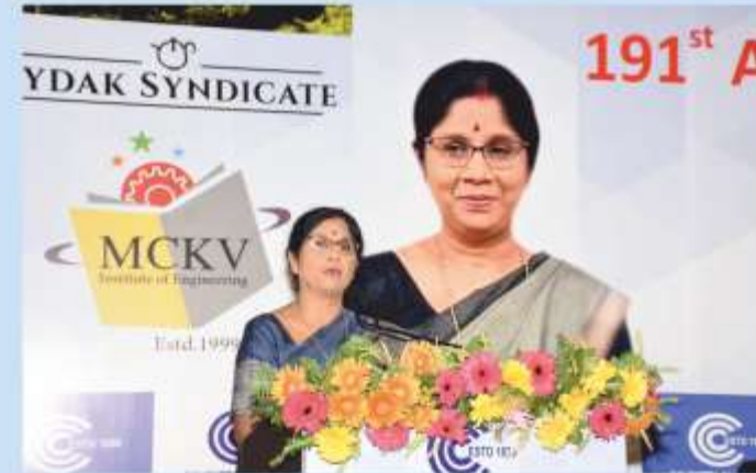
Dr. Shashi Panja, Hon'ble Minister of Industry, Commerce & Enterprises and Public Enterprises & Industrial Reconstruction, Govt. of West Bengal addressing the Annual General Meeting.