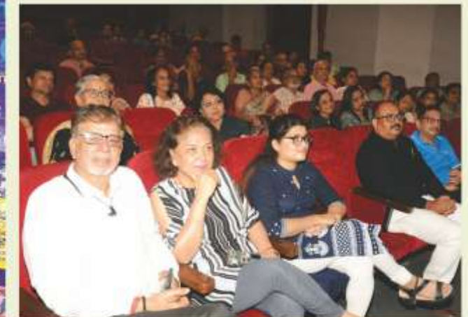
A glimpse of the gathering