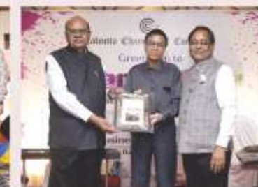
Dr. Sanjay Gupta