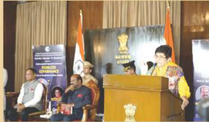
Dr. Kiran Bedi, Hon'ble Former Lt. Governor of Puducherry sharing her thoughts on good governance.

The Calcutta Chamber of Commerce organized a Book Launch and a Special Lecture Session on "Fearless Governance" on Thursday, 18th May 2023 at The Raj Bhawan. The session was addressed by the Chief Guest - Dr. C. V. Ananda Bose, Hon'ble Governor of West Bengal and Guest of Honour Dr. Kiran Bedi, Hon'ble Former Lt. Governor of Puducherry and a distinguished author.