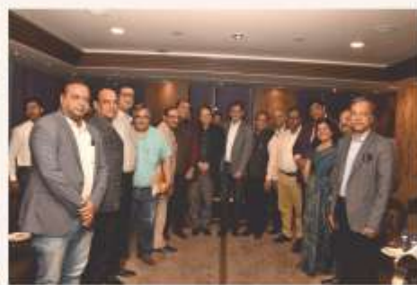
Members of CCC & ACAE with Hon'ble Dr. Atiur Rahman.