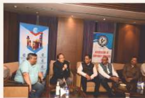
Dr. Atiur Rahman, G-20 Sherpa (Economic Advisor) to Bangladesh Prime Minister & Former Governor of Central Bank of Bangladesh dwelling on Indo-Bangladesh Economic Outlook.