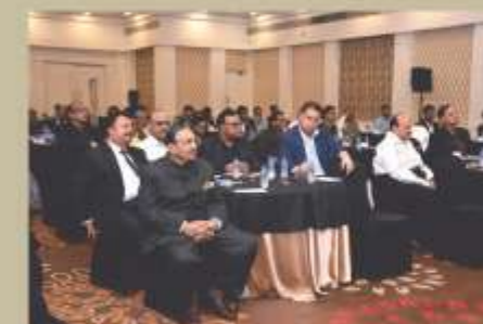
A section of the gathering.