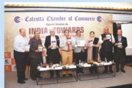
Hon'ble Dignitaries, Office Bearers & Past Presidents releasing the Members Directory 2022.