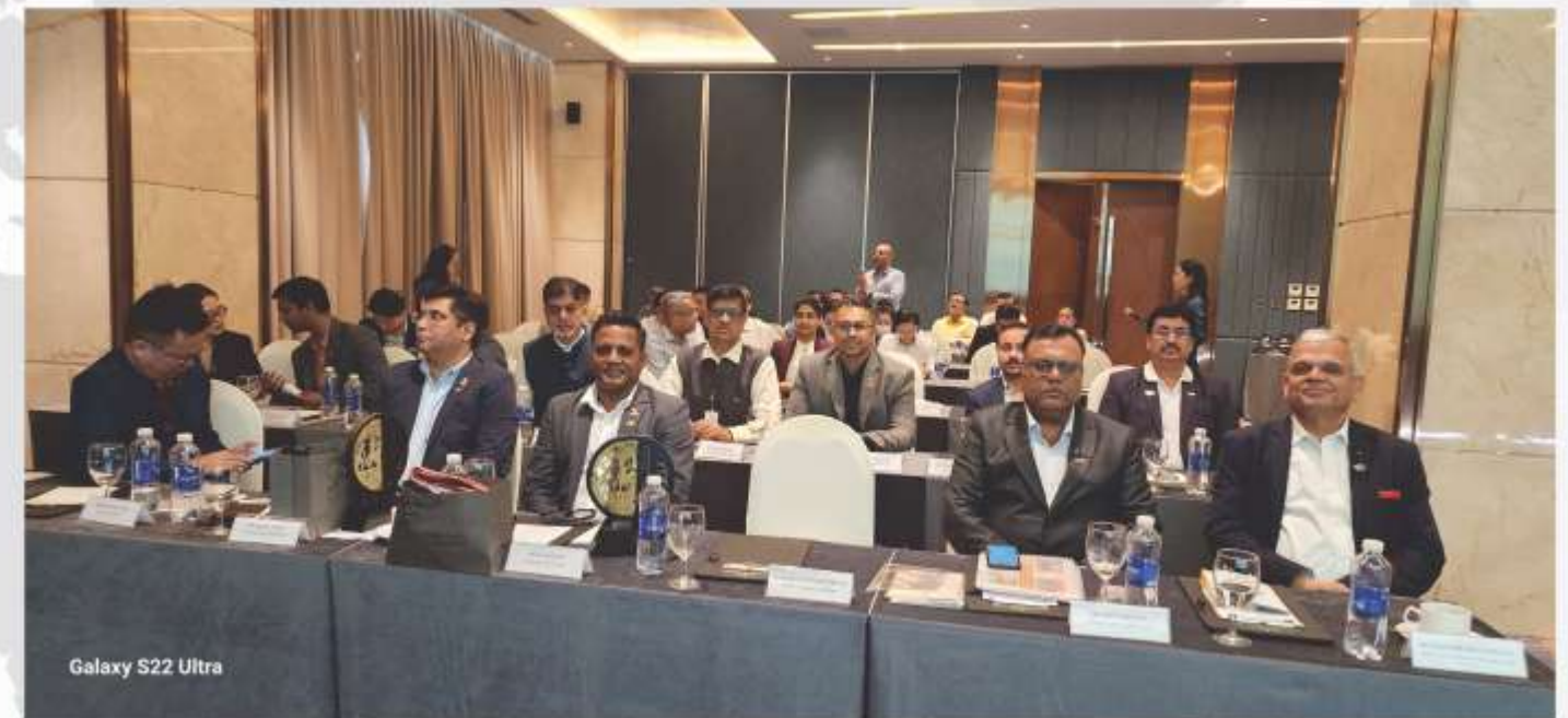
Meeting of the Members of the CCC delegation and Members of INCHAM at Ho Chi Minh city.