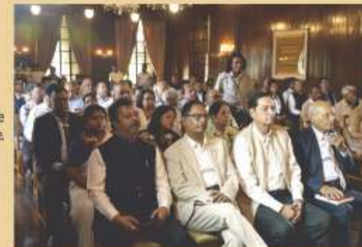
A section of the audience.