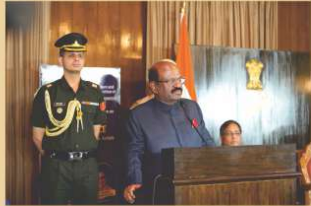
Hon'ble Governor of West Bengal Dr. C.V. Ananda Bose making his remarks on Fearless Governance.