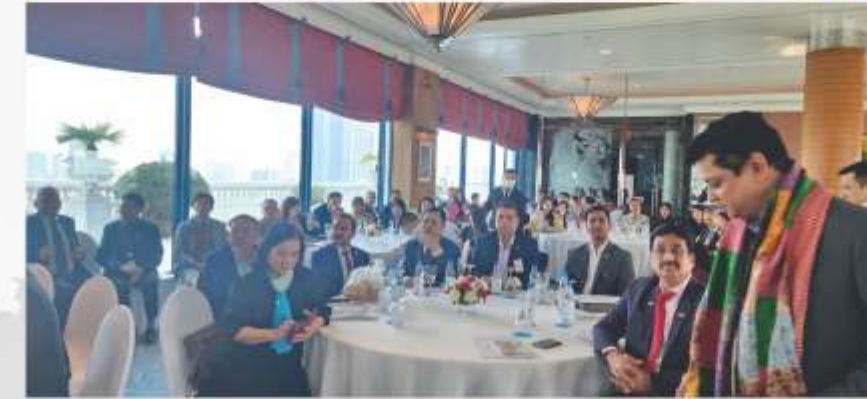
The Seminar and B2B Session at Hanoi is in Progress.