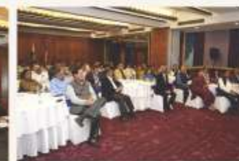
A section of the gathering