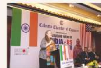
Ms. Melinda Pavek, USA Consul General speaking on the India-US relationship.

The United States and India have very strong economic partnership. The growth size has been very amazing - by almost seven times in eighteen years and that has been a remarkable achievement. It is ensuring shared and sustainable economic prosperity for the United States and India by promoting trade & economic growth.