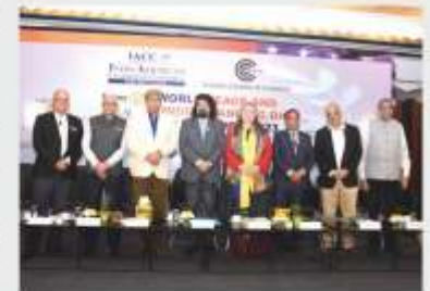
Hon'ble dignitaries at the session.