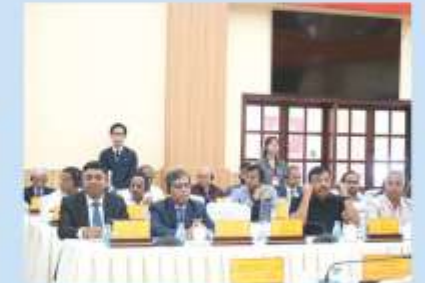
The conference is in progress.