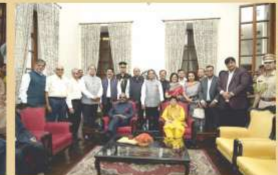
Office Bearers and members of CCC with Hon'ble Governor of West Bengal Dr. C. V. Ananda Bose and Hon'ble Former Lt. Governor of Puducherry Dr. Kiran Bedi.