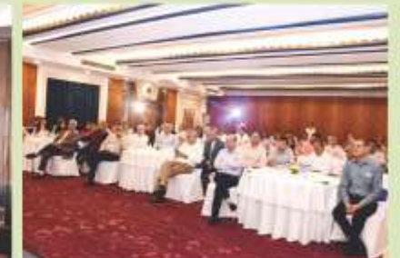
A glimpse of the gathering.