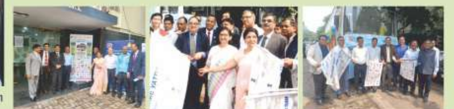
A Flag-off event for a Bus was organized as a part of the programme.