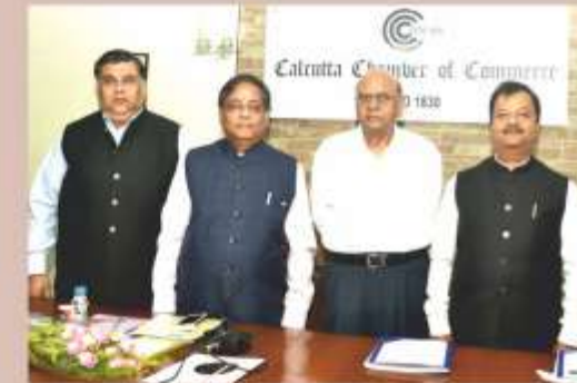
The newly elected Office bearers of the Chamber.