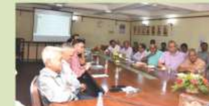
A section of the audience