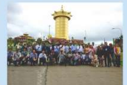
Members of the delegation visiting Samten Hill