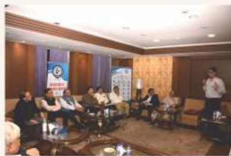
Interactive Session is in progress.