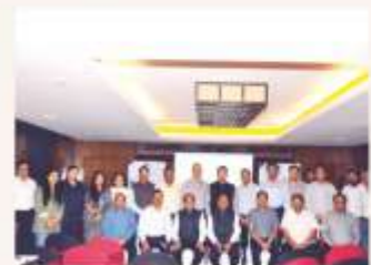
Members of the Chamber