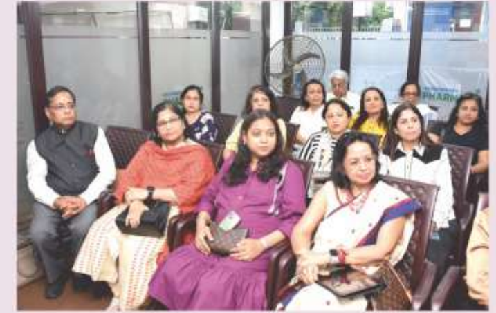
A section of the audience.