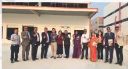
CCC delegation at the Ba Thien Industrial Park