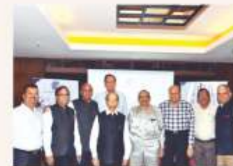
Office bearers & Past Presidents of the Chamber