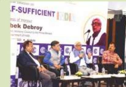
Interaction with audience

The renowned economist also said the rate of population growth in India was slowing down sharply, and the burden of the aged will be a challenge for the country after 2035. Social security for the aged can be managed if there is a balanced population pyramid, with young people coming into the labour force and their contributions financing the social security needs of the old, he stated.