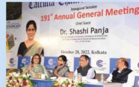
Hon'ble Minister Dr. Shashi Panja interacting with the members of the Chamber.