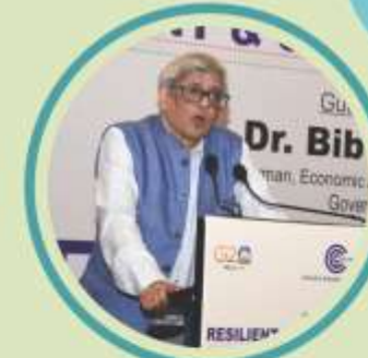
Dr. Bibek Debroy, Hon'ble Chairman, EAC to the Prime Minister elaborating on the strength of the Indian economy.