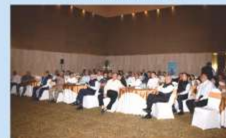
A glimpse of the gathering